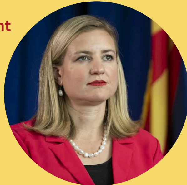
Mayor Kate Gallego City of Phoenix