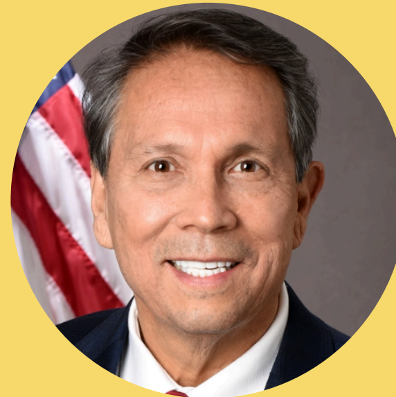
Mayor David Ortega City of Scottsdale